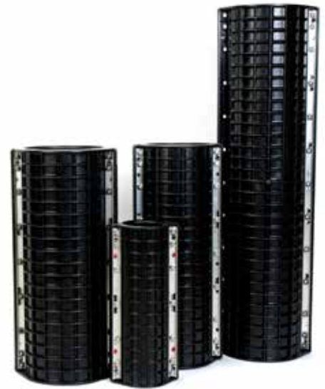
3M™ Pressurized Closure System 2-Type 505